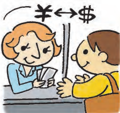
8. exchange money