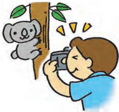
1. take a picture