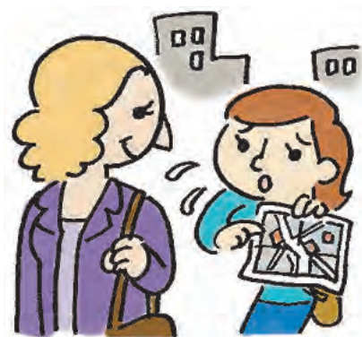
4. ask the way