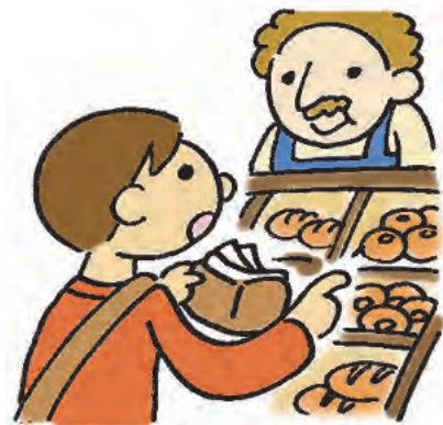
3. ask the price