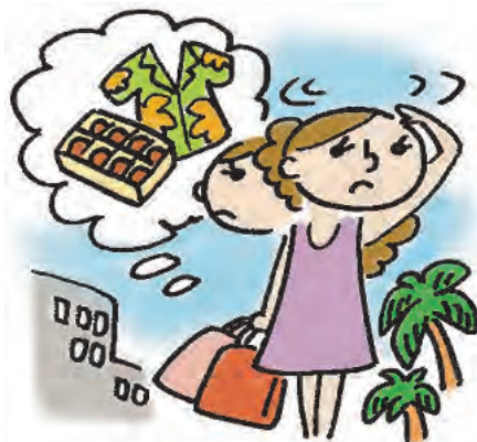
5. look for souvenir