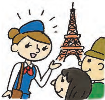
2. go to sightseeing