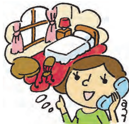
9. reserve a room