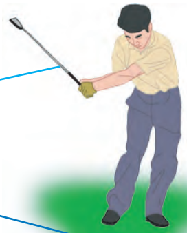
9. golf ball