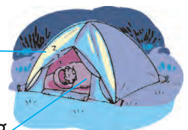
18. sleeping bag