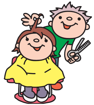
3. hair dresser