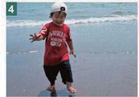
4 Young child walking on his own

Have a conversation with your teacher using the forms “too~to...”, “~enough to ...”and the pictures below. You may use the words given.