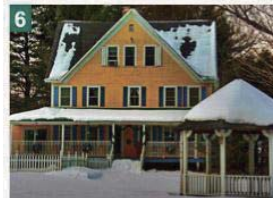
6 Cold outside