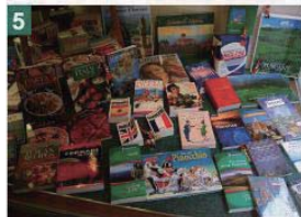
5 Reading books