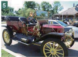
Classic car expensive